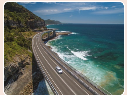
Seacliff Bridge www.grandpacificdrive.com.au