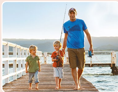
South Coast Leisure Times www.southcoastleisuretimes.com.au