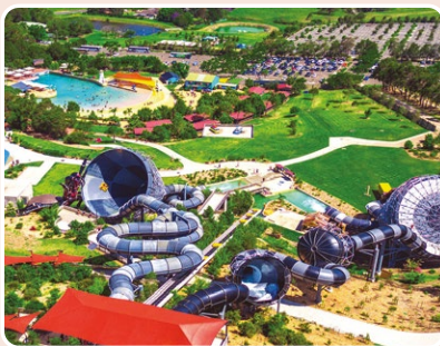
Jamberoo Action Park www.jamberoo.net

www.visitshellharbour.com.au/visitor-guide